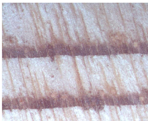
Figure 1. Cross-section of Pinus leucodermis wood with numerous resin canals.

Straight-grained mature heartwood of P. leucodermis , with an average number of 6–8 annual rings \text{cm}^{-2} , was collected from a high-altitude forest area of Pindos in north-west Greece. After a slow air-drying process of 6 months, small, clear wood specimens